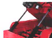
Dump System - Pivot Point & V-Body