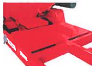
Platform For Safe, Easy Hopper Access