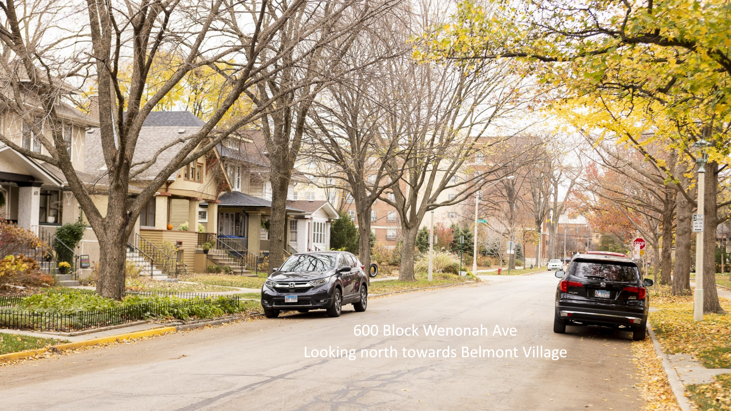
600 Block Wenonah Ave Looking north towards Belmont Village