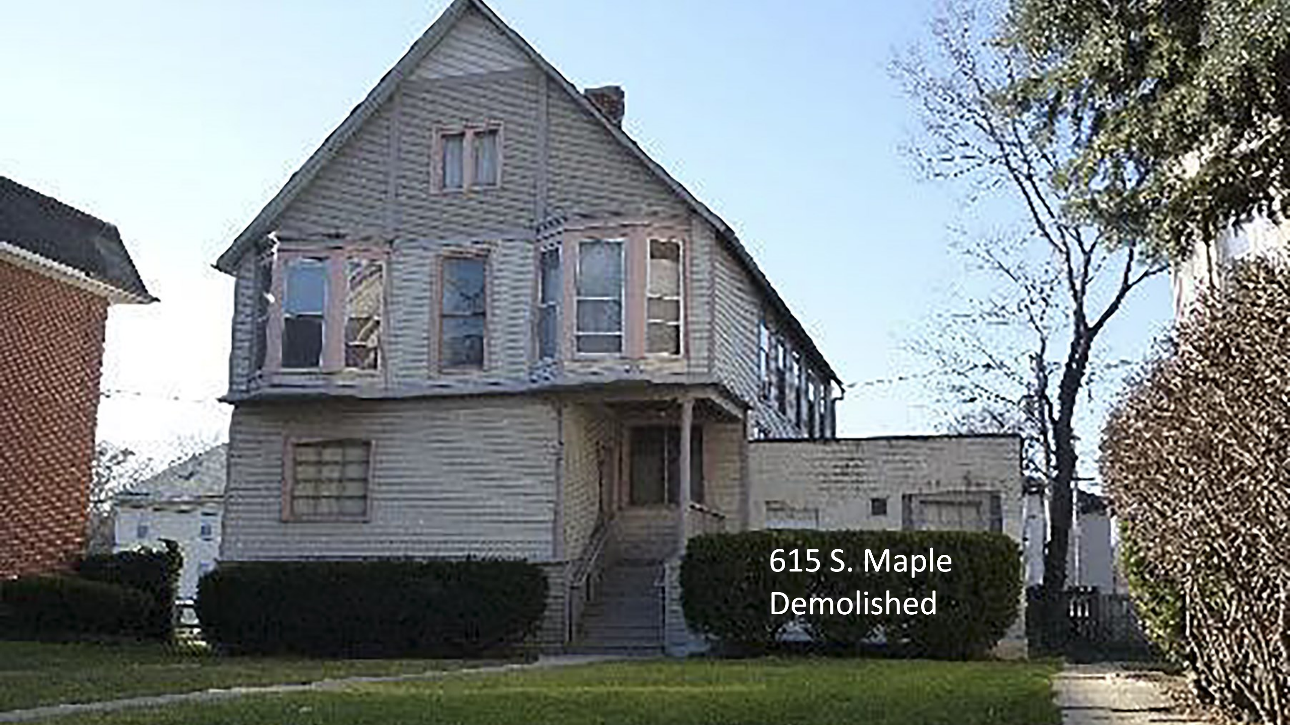
615 S. Maple Demolished