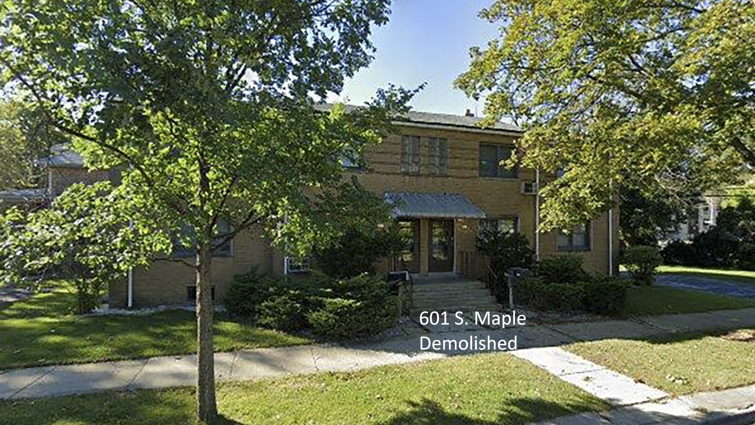
601 S. Maple Demolished