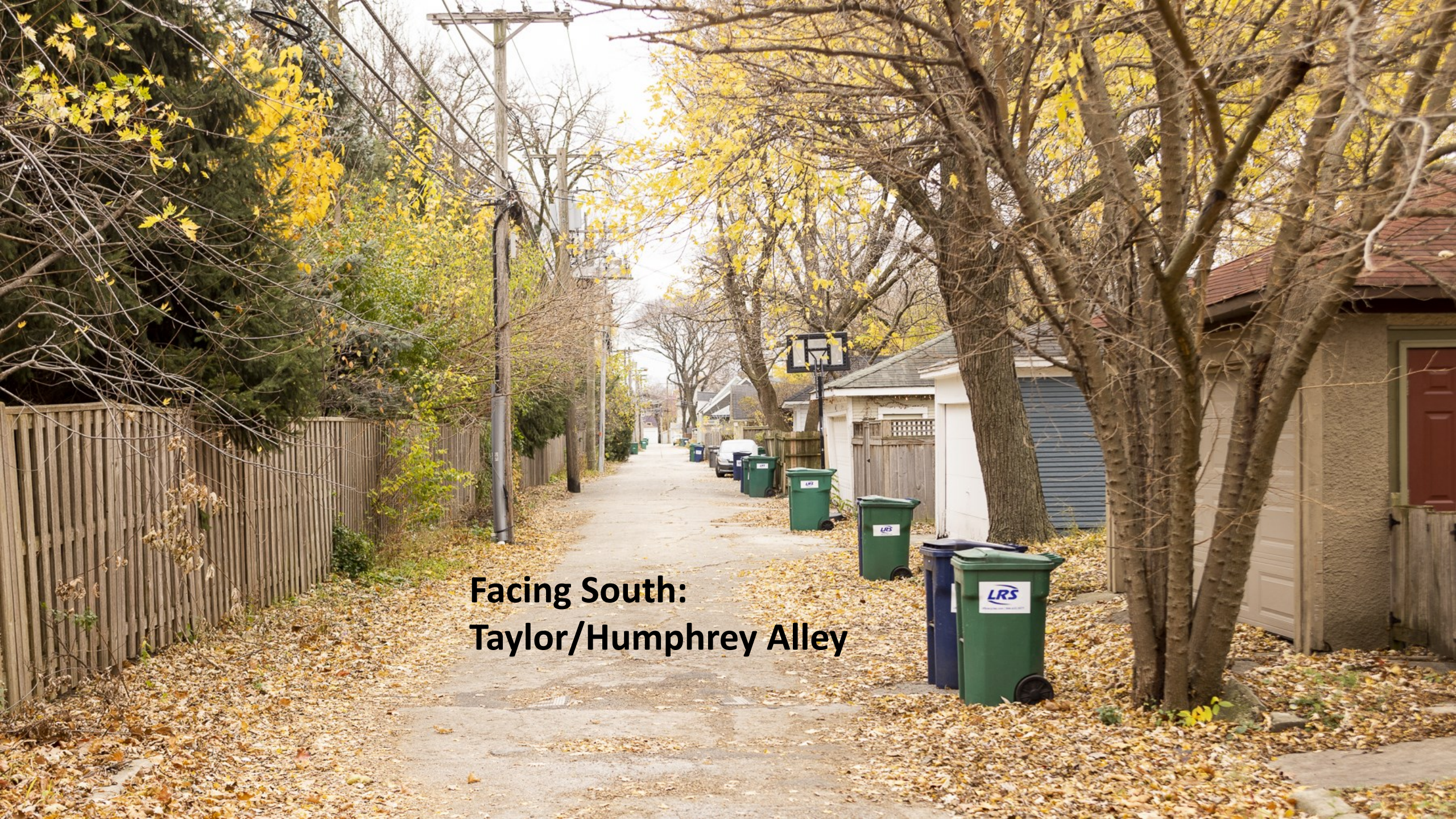
Facing South: Taylor/Humphrey Alley