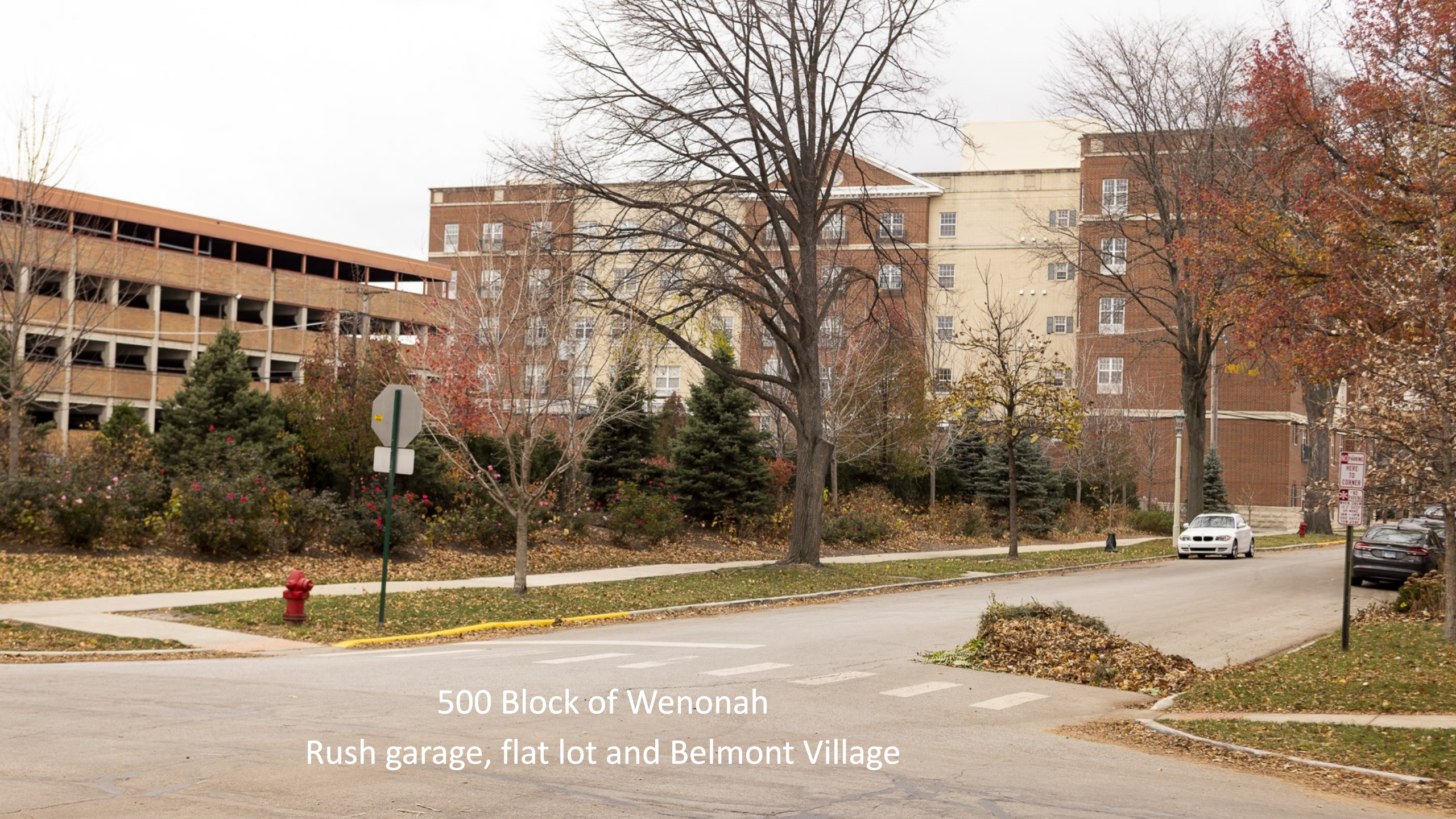
500 Block of Wenonah Rush garage, flat lot and Belmont Village