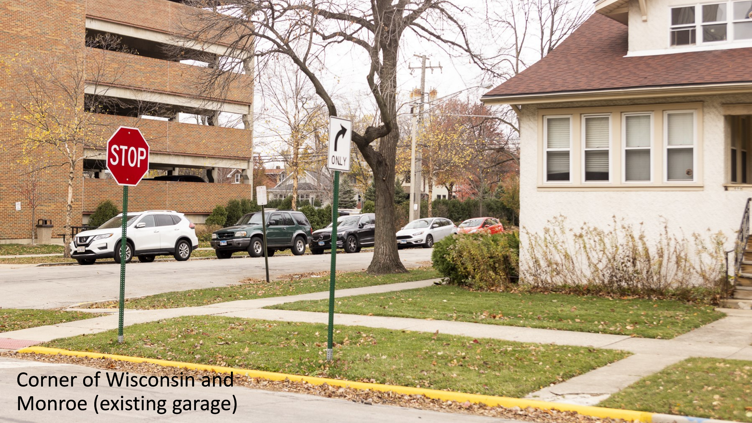
Corner of Wisconsin and Monroe (existing garage)