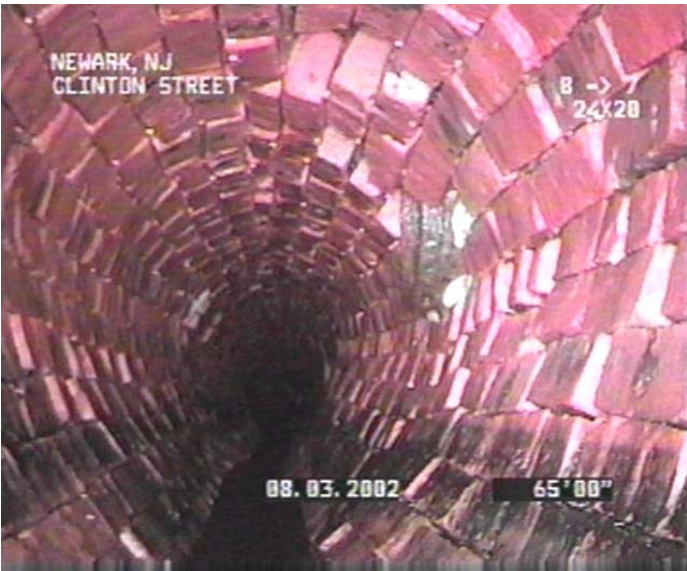
Figure 3. Example of Condition Grade 3 Brick Collapse Unlikely in Immediate Future; Further Deterioration Likely