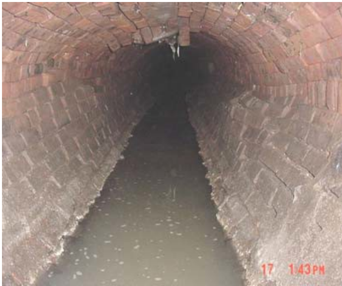
Figure 4. Example of Condition Grade 4 Brick Sewer - Sewer- Collapse Likely in Foreseeable Future