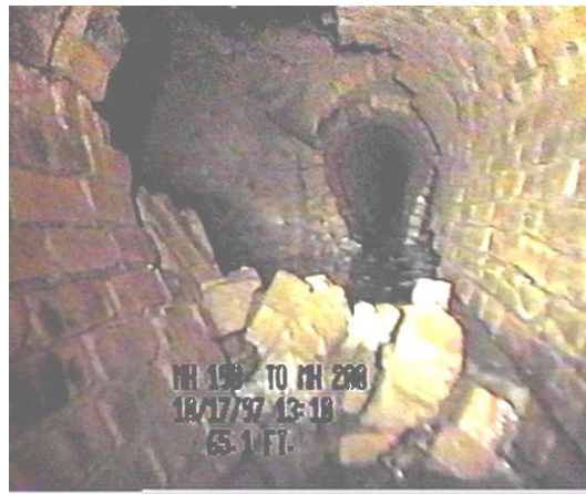
Figure 5. Example of Condition Grade 5 Brick Sewer- Collapsed or Collapse Imminent