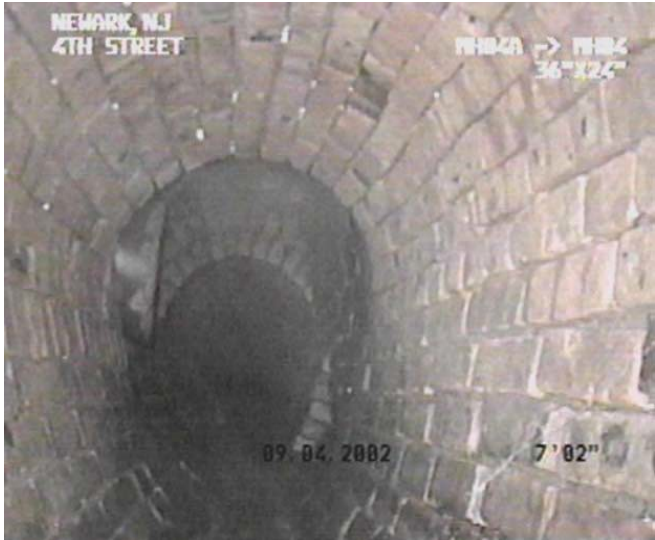
Figure 2. Example of Condition Grade 2 Brick Sewer- Minimal Potential for Short-Term Collapse; Further Deterioration Probable