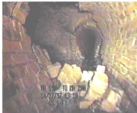
Figure 5. Example of Condition Grade 5 Brick Sewer- Collapsed or Collapse Imminent