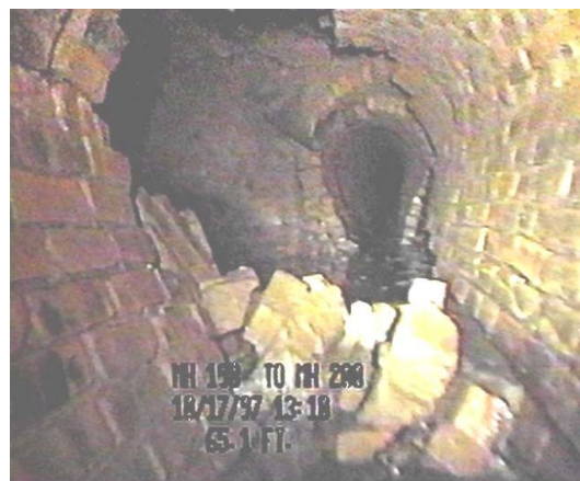
Figure 5. Example of Condition Grade 5 Brick Sewer- Collapsed or Collapse Imminent