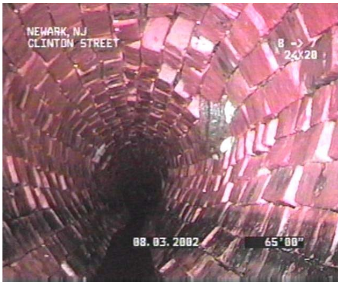
Figure 3. Example of Condition Grade 3 Brick Sewer Collapse Unlikely in Immediate Future; Further Deterioration Likely