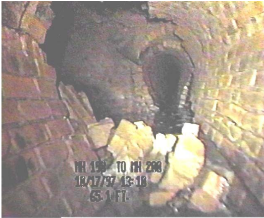
Figure 5. Example of Condition Grade 5 Brick Sewer- Collapsed or Collapse Imminent