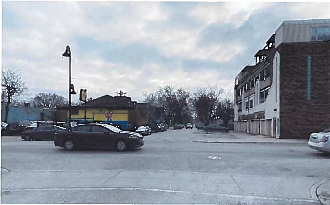
Highland Ave. on Berwyn side with a cul-de-sac and multi-unit residential buildings