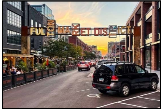
Fulton Market Gateway: Chicago, IL on W Fulton St. near Halstead St.

North Avenue is a heavily used arterial carrying over 31,000 vehicles per day. The centerline of North Avenue is the border between the Village of Oak Park and the City of Chicago. Numerous pedestrian and vehicle safety related concerns exist along this congested corridor along with challenging conditions for development and the existing commercial businesses due to the high-speed nature of the roadway and lack of safe pedestrian access to both sides of the road.