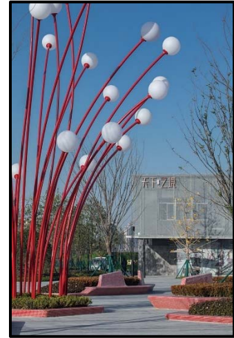
Hefei Vanke plaza entrance in Hefei, China

Design of the North Avenue Safety Improvement Project would start shortly after the execution of a CPF Grant Agreement which is anticipated in the second quarter of 2023. Design of the project is anticipated to be completed in late 2024 for construction to occur in 2025. Construction of the North Avenue Safety Improvement Project would be coordinated with a separate planned City of Chicago led streetscaping project on North Avenue, anticipated for 2025.