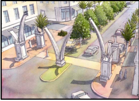
Gateway Concept for Jeddah, Saudi Arabia by Dover, Kohl & Partners

The scope of the proposed North Avenue Safety Improvement Project will consist of the Phase 1 preliminary design of the project which will include the conceptual design of the gateways, the preliminary engineering design, environmental reviews, and public engagement; the Phase 2 Engineering Design which will include the development of detailed plans and specifications and cost estimates; and the Phase 3 construction of the project which includes the fabrication and installation of the gateways and all associated construction related work for pavement removals, electrical, drainage and utility