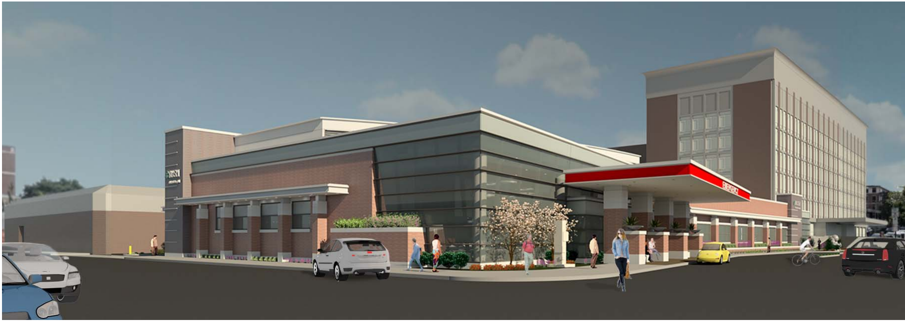
MADISON STREET LOOKING SOUTHEAST