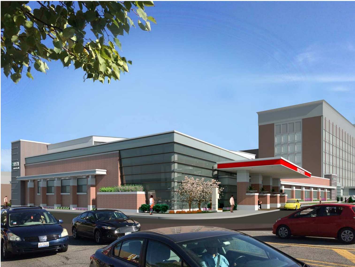
MADISON STREET LOOKING SOUTHEAST