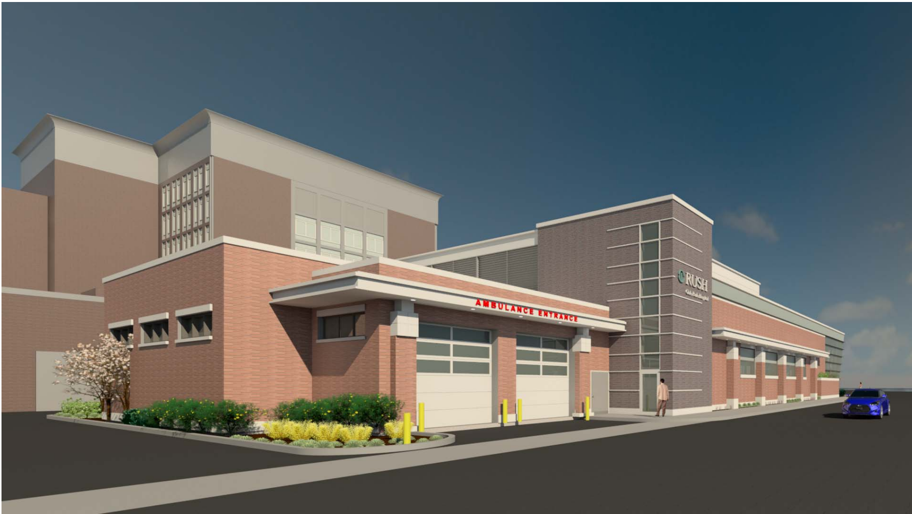
MADISON STREET LOOKING WEST