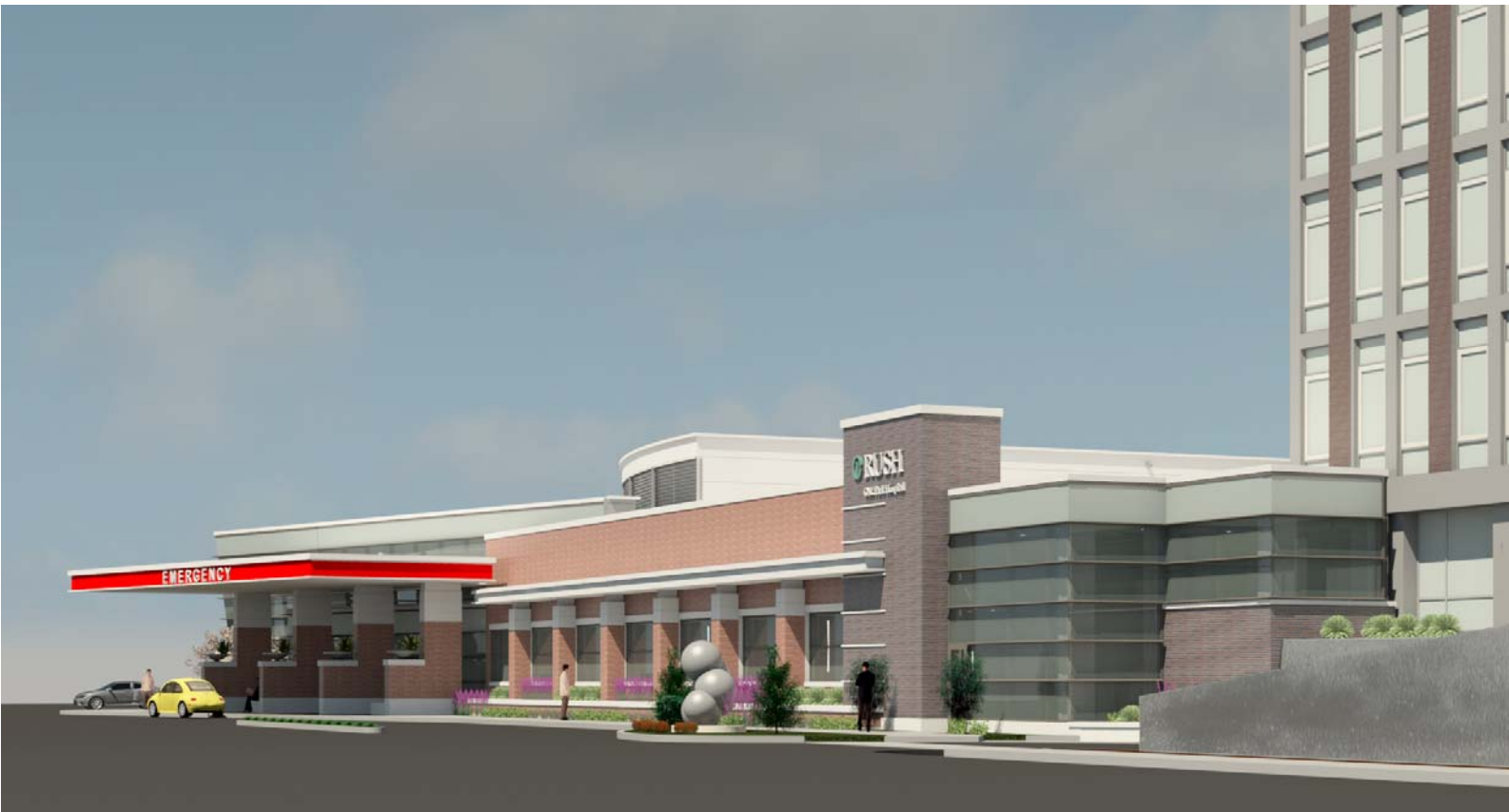
MAPLE AVENUE LOOKING NORTHEAST