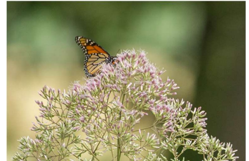
Monarch butterfly, Hackmatack National Wildlife Refuge, McHenry County.

Please note that 2018 grant cycle applications are not required to have a pollinator focus. However, all applicants are encouraged to consider how pollinators might be supported by their particular project. Eligible applications for projects that meet regular Program Guidelines will still be accepted for consideration, regardless of whether they focus on pollinator conservation.