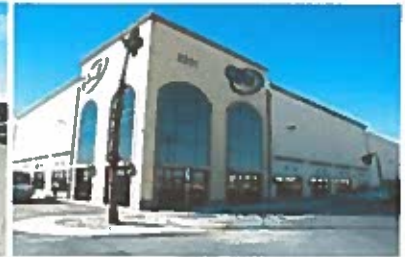
513,000-square-foot distribution center in NV

distributing products to customers east of the Mississippi River while the Las Vegas (LV) distribution center primarily serves the western part of the United States.