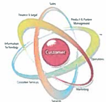
CDW Circle of Service

CDW continues to maintain the strong customer focus that has been the key to our success. We adhere to a core philosophy known as the CDW Circle of Service, which means that everything we do revolves around you – the customer. It drives us to provide outstanding customer service and the best value. Our objective is to have our customers view us as a valuable extension of your IT staff. We seek to achieve this goal by providing superior customer service through our large and experienced sales and service delivery teams. Our Market Research Team works with a third-party research firm to measure customer loyalty and satisfaction through customer surveys.