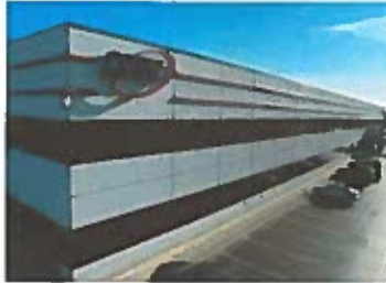
450,000-square-foot distribution center in IL

CDW has a 450,000-square-foot distribution center located at our headquarters in Vernon Hills, IL and a 513,000-square-foot distribution center located in North Las Vegas, NV. These locations facilitate quick distribution of products to our growing customer base throughout the country. The Vernon Hills (VH) distribution center focuses on