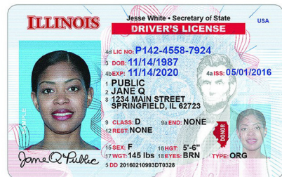
New Illinois ID

Note: Both versions are valid, but it's important to make sure the expiration date has not lapsed.