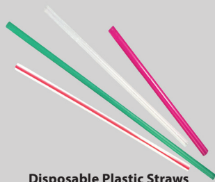
Disposable Plastic Straws