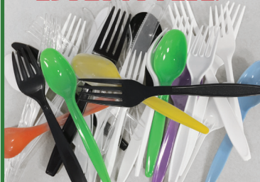
Disposable Plastic Utensils