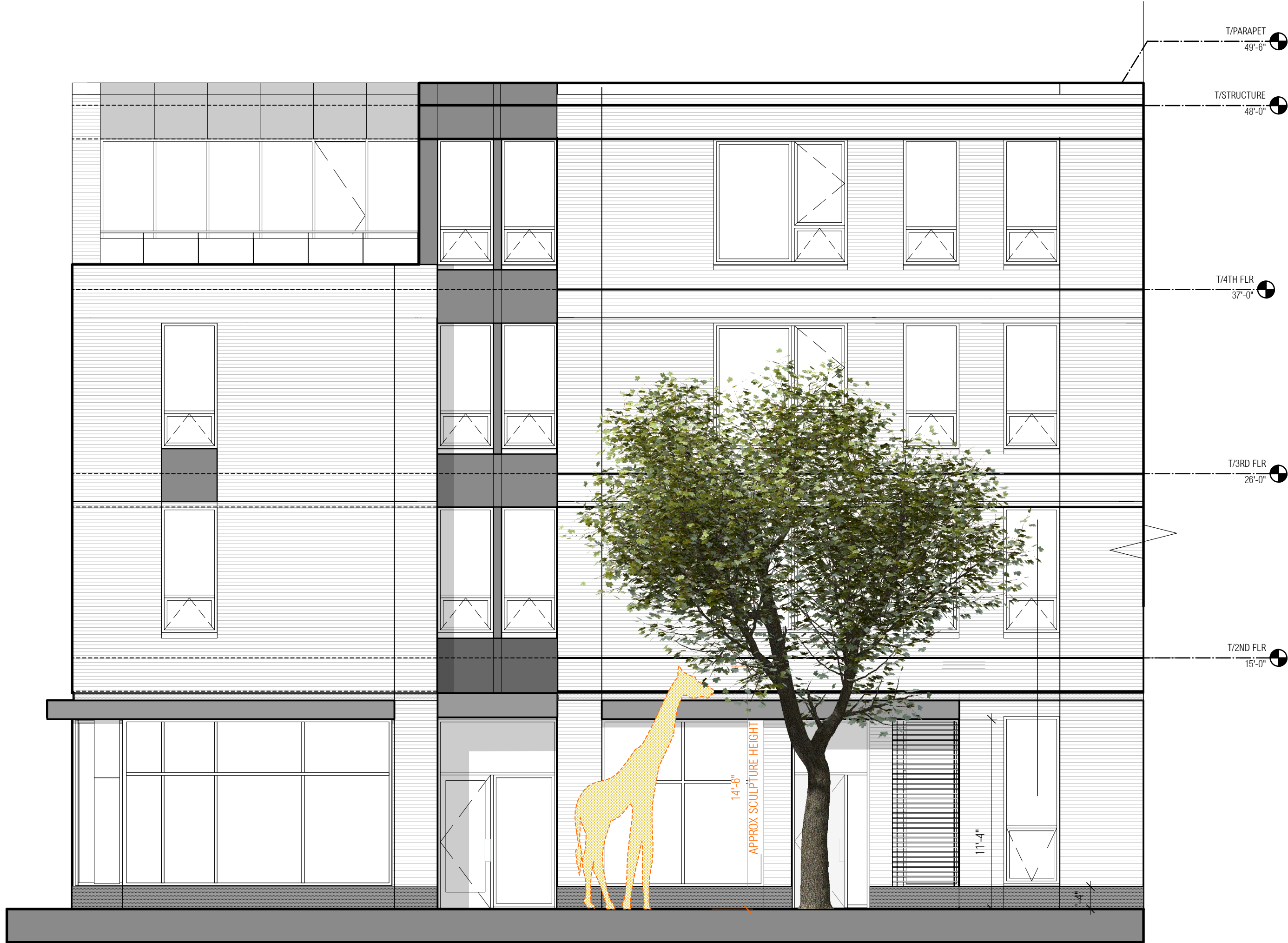
1 NORTH EXTERIOR ELEVATION - FACING VAN BUREN STREET - WITH PROPOSED SCULPTURE SCALE: 3/16"=1'-0"